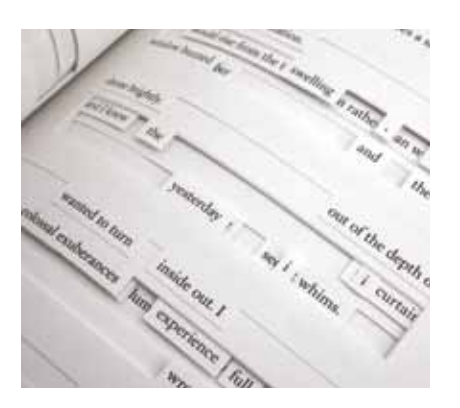
Pages from Jonathan Safran Foer's Tree of Codes, 2010.

evidence that parts of it have proceeded from an extraordinary man," he wrote, "and that other parts are of the fabric of very inferior minds. It is as easy to separate those parts, as to pick out diamonds from dunghills." With the help of a razor blade and six books of the New Testament